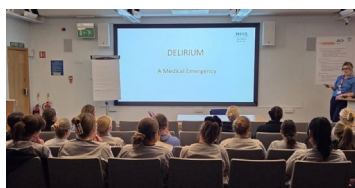
Figure 2: Lecture Theatre at University Hospital Crosshouse.