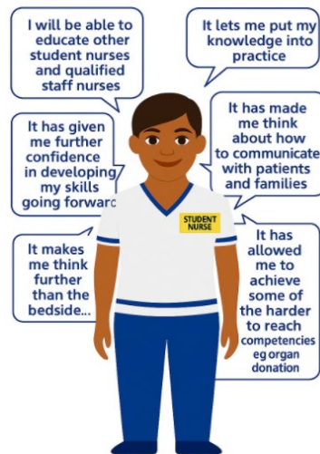
Figure 6: Quotes from student feedback.

Students identified they had increased confidence, clearer application of knowledge to practice and improved awareness of best-practice standards (Figure 6).