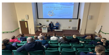
Figure 1 – Lecture Theatre at University Hospital Ayr

Students from stakeholder education providers were invited to attend the weekly forums hosted within both acute hospital sites, (Figures 1&2). Forums were promoted via the Practice Education Facilitators (PEF) in collaboration with University and College partners (Figure 3), with voluntary student attendance supported via clinical placement areas.