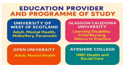
Figure 3: Student participants