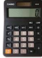
6. Casio MX 8B-WE*/ MX 8B*