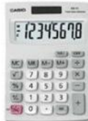
5. Casio MX-8S-WE* (also known as MX-8S*)