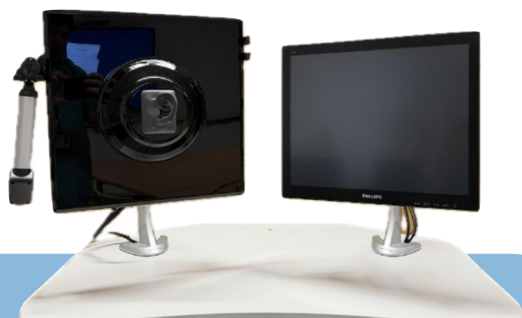
Fig. 2: EarSi Otoscopy Simulator from Haag-Streit

‘The simulator was helpful as this allowed supervisors [those delivering teaching] to feedback on my examination technique ’