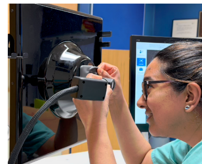
Fig. 3: The EarSi Otoscopy Simulator in use

All respondents reported the otoscopy simulator was 'very useful.'